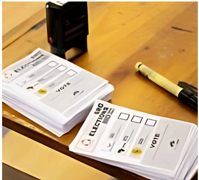
Black Hat ballot paper for elections at PE College.