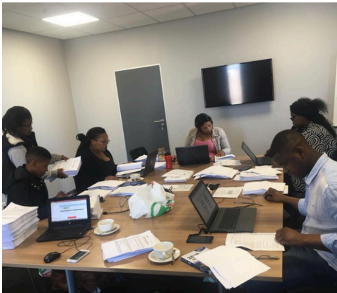
Black Hat staff are doing data capturing after fieldwork for a Research Chair at Nelson Mandela University.

Deliver high-quality convenings and knowledge platforms that translate stakeholder inputs into actionable insights, reports, and strategic direction.